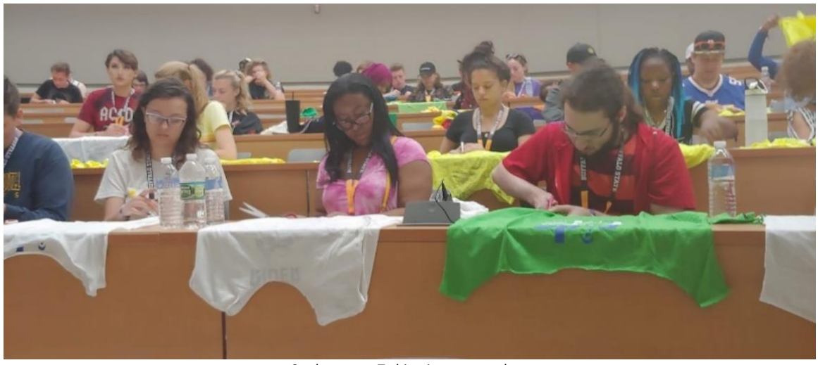
Students turn T-shirts into grocery bags

Reusable Grocery Bags for the Lieutenant Colonel Matt Urban Hope Center: 500 shopping bags were made from donated t-shirts for food pantry clients to reuse.