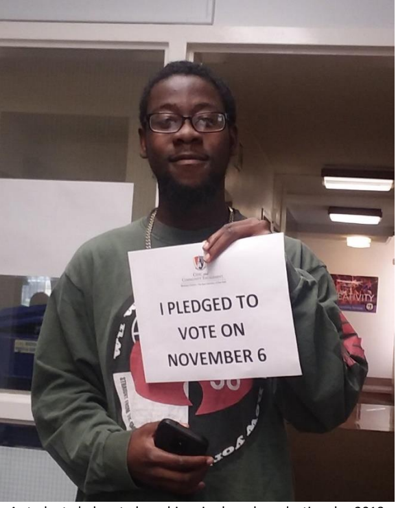
A student pledges to have his voice heard on election day 2018

On behalf of the college, the CCE convened a work group to create an action plan for implementation in 2020-2021 so the college can be designated as a "Voter Friendly Campus" by the ALL IN Campus Democracy Challenge and Campus Vote Project.