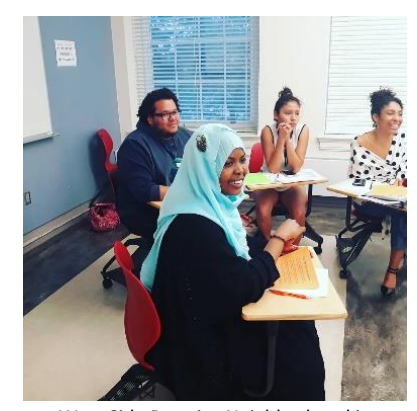
West Side Promise Neighborhood in Leadership Class

The implementation plan is simple. Empower diverse facilitators from all walks of life to present on themes and content areas they feel are relevant to leadership and provide that information to the participants supplemented with some of the skills sets and experts we have on campus and within the WSPN Network. Twenty-six people graduated this year: WSPN's 5<sup>th</sup> anniversary!