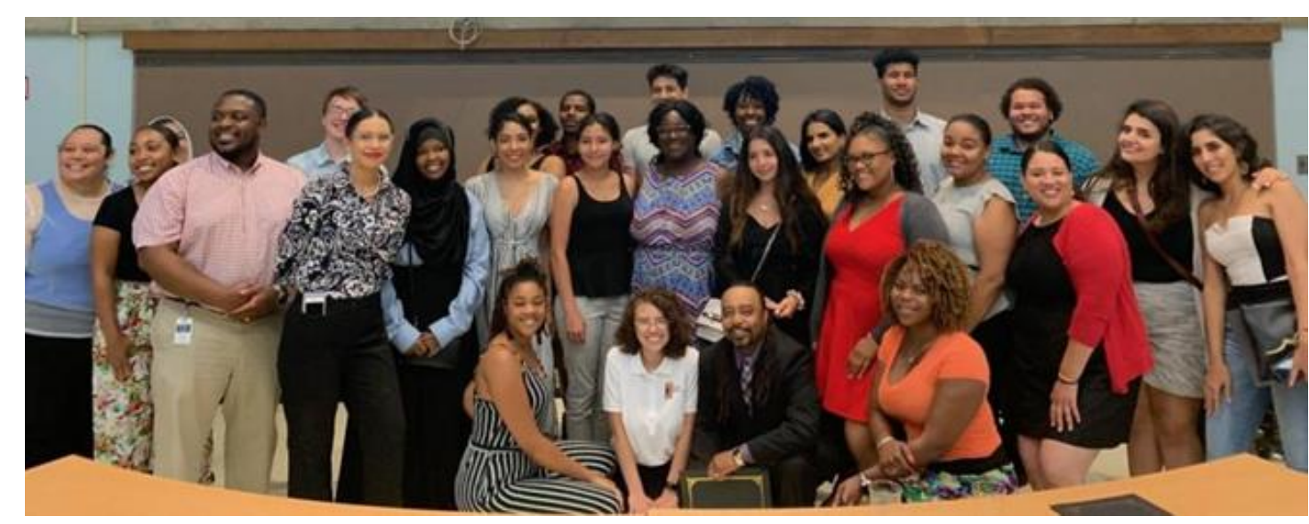
West Side Promise Neighborhood Graduation Ceremony