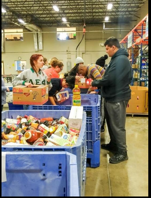
Alternative Break Participants sort food in Cleveland, Ohio

Students identified and articulated the relationship between poverty and food, and what solutions were being implemented to fight the challenges in Baltimore.