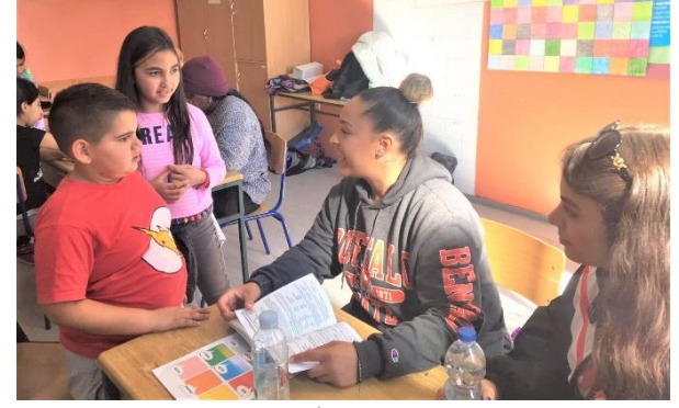
IPDS student in Croatia

To prepare new teachers more effectively for the changing educational context, IPDS was developed by utilizing the existing PDS structures. Through the international contacts of our education faculty, IPDS was established in 2012 with two short-term, faculty-led study-away programs. IPDS now includes PK-12 school partnerships across five continents, as well as a virtual partnership in La Esperanza, Honduras.