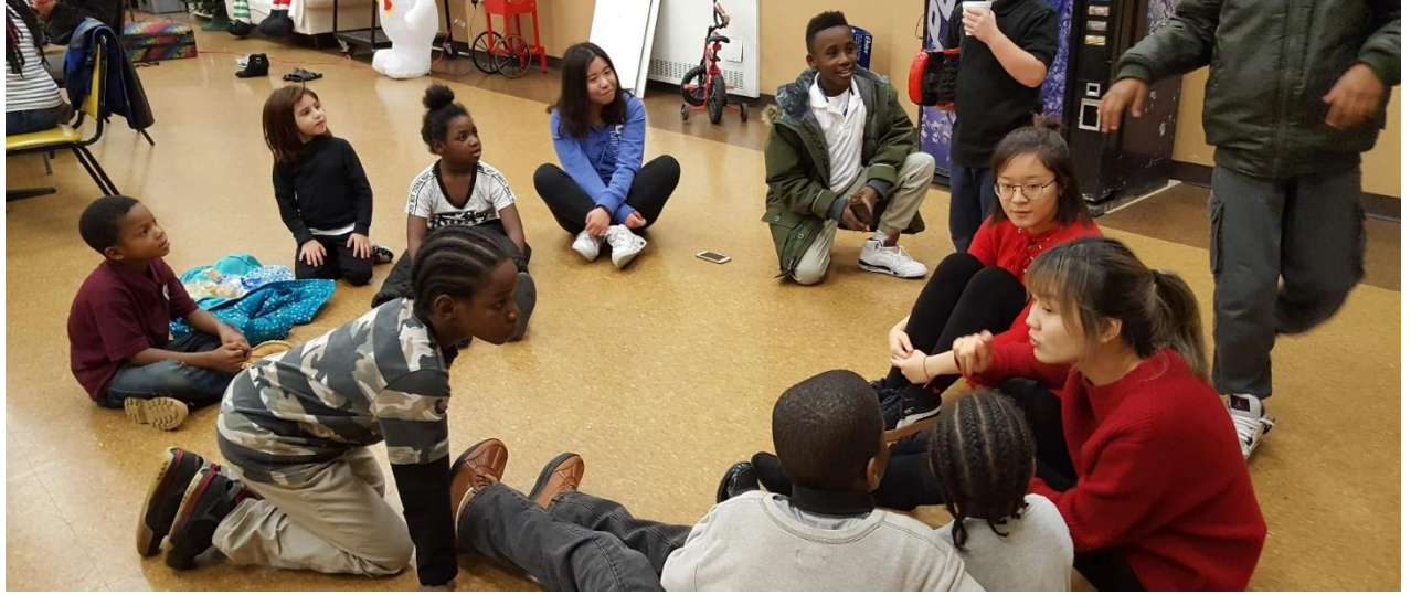
DAN 201 Teaching Creative Movement for Children students teach dance to Buffalo Public School children

At SUNY Buffalo State, service-learning courses offer opportunities for student applied-learning and civic engagement, while also partnering with community organizations to meet identified community needs.